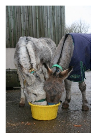
Photo 13. A rug is a useful supplement to man-made shelter in donkeys that are elderly or unwell