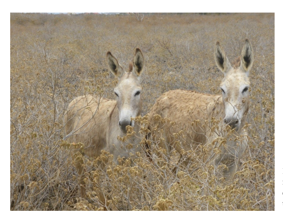
Photo 1. Knowledge of the natural behaviour of donkeys derives mainly from studies of them in their natural habitat.

Today's domestic donkey and many of the world's feral and semi feral donkeys are descended from the African wild ass ( Equus africanus ). A separate branch of wild asses evolved in Asia, no species of which has been domesticated but whom share many characteristics with African wild asses. African wild asses evolved to live in semi-arid environments with sparse, highly fibrous food sources and limited access to water. The behavioural repertoire of the wild asses and their descendent, the domestic donkey, has enabled these species to thrive in these conditions and renders their behaviour significantly different from that of horses and ponies. Knowledge of natural donkey behaviour derives mainly from studies of wild and feral donkeys that live under natural or semi natural conditions with no or little human interference.