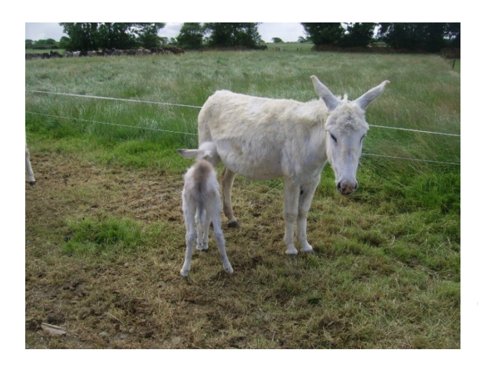
Photo 22. Colostrum is the essential health ingredient for donkey foals

The jenny should be kept in the environment where foaling is to take place for at least one month before foaling, in order for her to produce colostral antibodies related to this environment.