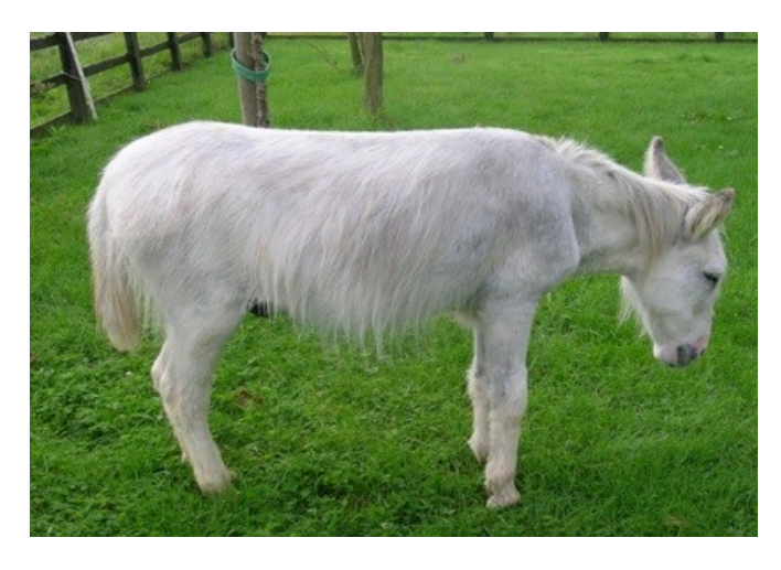
Photo 9. The stoic donkey might just look dull but in reality be masking a genuinely life-threatening condition

The term 'stoic' is often used to describe donkey behaviour and can be misleading. Stoicism is typical predator-avoidance behaviour in a prey species such as the donkey; appearing strong and normal reduces the chances of a predator singling a donkey out. This stoicism (or 'masking behaviour') should not be (mis)interpreted as a lessened ability to experience pain and distress. The donkey's behaviour is different from that of horses and ponies and it is crucial that this is taken into account when training, using, caring for or treating donkeys. Their stoic nature may lead to missing or misdiagnosing the severity of painful conditions or may lead to handlers not understanding the donkey's emotional state. A donkey is likely to show fewer or subtler signs of pain and distress when compared with a horse experiencing the same clinical issue.