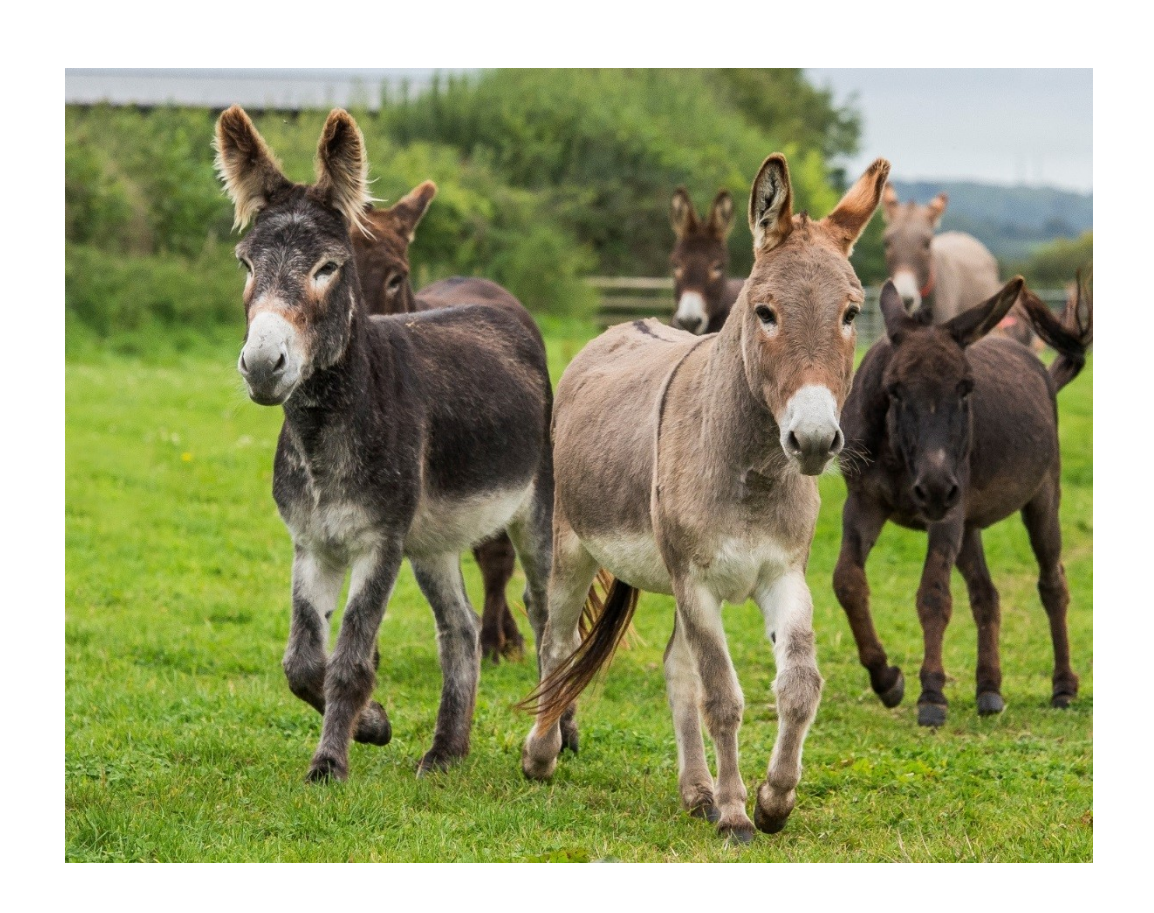
Guide to good animal welfare practice for the keeping, care, training and use of donkeys and donkey hybrids