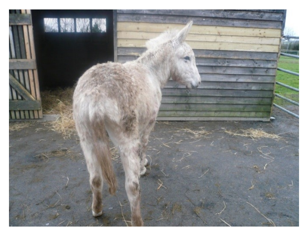
Photo 12. A shed and hard standing make ideal shelter for donkeys in winter conditions

Donkeys have evolved to live in semi-arid environments and research has shown that they are less adapted to the wet conditions experienced in temperate climates and make use of shelter more frequently than other equidae under such conditions. Sufficient shelter should be available all year round; in the summer to provide donkeys with shade from the heat of the sun and protection from flying insects, and in winter to protect them against wet, windy and cold conditions. The shelter should be large enough to provide protection to all donkeys at the same time.