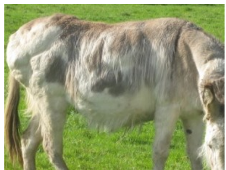
Score 5 (very fat)

Neck thick, crest bulging with fat and may fall to one side. Shoulder rounded and bulging with fat. Withers broad, bones felt with firm pressure. Large, often uneven fat deposits covering dorsal and possibly ventral aspect of ribs. Ribs not palpable dorsally. Back broad, difficult to feel individual spinous or transverse processes. More prominent crease along midline fat pads on either side. Crease along midline bulging fat either side. Cannot feel hip bones, fat may overhang either side of tail head, fat often uneven and bulging.