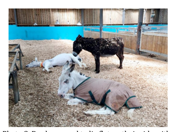
Photo 8. Donkeys need to lie flat on their side with extended legs, neck and head to enter deep sleep