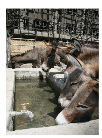
Photo 17. Although relatively thirst-tolerant donkeys should be provided with a source of clean, palatable drinking water

Donkeys' need for water depends mainly on the level of activity, ambient temperature, and water content of their feed. Donkeys will typically drink 5-10% of their body weight daily. Lactating jennies and donkeys with a high level of activity such as working donkeys may need more water. In donkeys' natural habitats water is normally in short supply and sparsely located. This has led to donkeys being more thirst-tolerant than horses and being able to rehydrate rapidly without adverse effects. Such thirst-tolerance and the natural adaptations to maintain appetite when dehydrated should not be mistaken for a reduced overall requirement for water, which remains similar to that of horses.