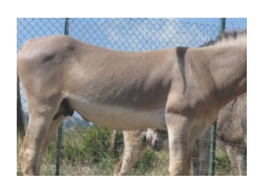
Score 3 (ideal)

Good muscle development, bones felt under light cover of muscle/fat. Neck flows smoothly into shoulder, which is rounded. Good cover of muscle/fat over dorsal spinous processes withers flow smoothly into back. Ribs just covered by light layer of fat/muscle, ribs can be felt with light pressure. Can feel individual spinous or transverse processes with pressure. Muscle development either side of midline is good. Good muscle cover in hindquarters, hip bones rounded in appearance, can be felt with light pressure.