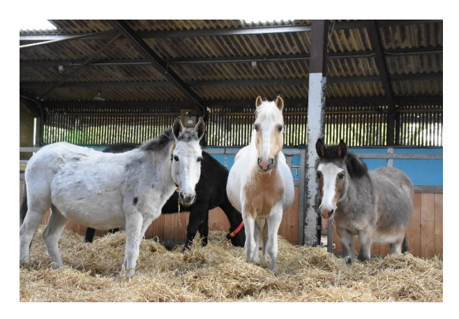
Photo 10. Donkey hybrids generally prefer the company of other hybrids or the maternal species

As mentioned above, donkeys are socially flexible animals who when resources allow seek to live in small family groups. Donkeys frequently form very strong pair bonds, which may last a lifetime. Pair bonded donkeys may be distressed by separation by a fence and in such cases taking a donkey out of sight or touch of a companion can seriously compromise welfare and make safe handling of individuals difficult. Companion bonding in donkeys is important when considering selling, relocating (for example for veterinary treatment) or killing an animal as animals, who are separated may be at risk of developing hyperlipaemia; a disease predisposed by stress which has a high mortality rate in donkeys. Donkey hybrids tend to prefer the company of other hybrids or of the maternal species and do not appear to demonstrate such strong companion bonds as donkeys.