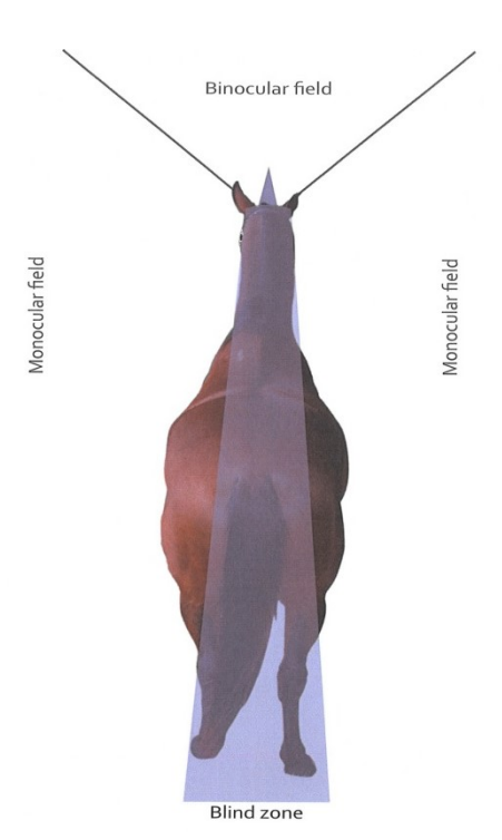
Photo 2. The field of vision of an equine, showing the binocular vision in front, the monocular vision at the side, and the blind spot behind and underneath the equine.

Donkeys have a wide-angled vision, which enables them to detect movements almost all around them. There is only a small "blind area" just behind them. There is also a small blind area in the shape of a triangle in front of the tip of the nose, which means that the donkeys does not see what they eat, but feels it with the whiskers.