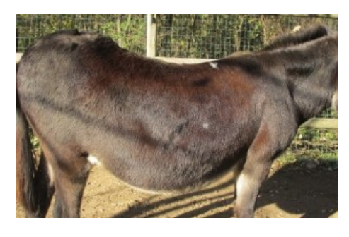
Score 4 (fat)

Neck thick, crest hard, shoulder covered in even fat layer. Withers broad, bones felt with firm pressure. Ribs dorsally only felt with firm pressure, ventral ribs may be felt more easily. Can only feel dorsal and transverse processes with firm pressure. May have slight crease along midline. Hindquarters rounded, bones felt only with firm pressure. Fat deposits evenly placed.