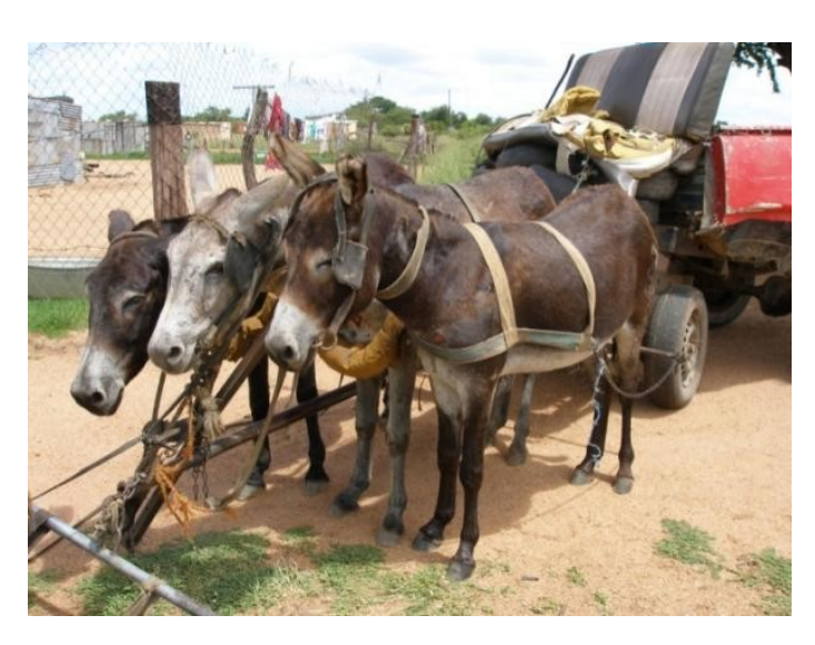
Photo 21. Passengers should be conscious of the welfare of taxi and tourist donkeys

Donkeys and mules are used for leisure activities or in connection with tourism in different ways. They are commonly used to transport passengers or luggage, for trekking, in festivals or to pull carts and wagons.