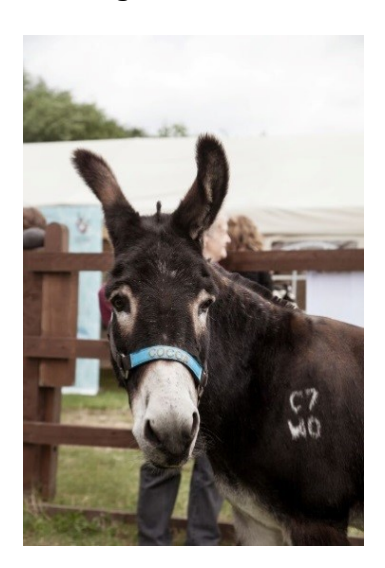
Photo 22. If undertaken, freeze branding should be done professionally

No other mutilations should be performed on donkeys, except castration, which should only be carried out by a veterinarian and performed under sedation and local anaesthesia or total anaesthesia, in both cases followed by long-lasting analgesia. Hot iron branding should be strongly discouraged. If freeze branding is undertaken, it should be done professionally.