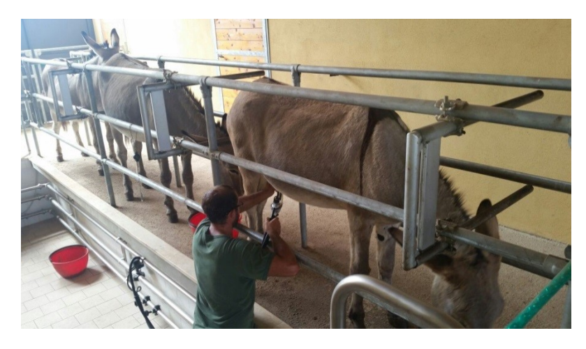
Photo 20. Good management practices are essential to the care of dairy donkeys

The new millennium has seen a growing number of dairy donkey farms. Although there is no specific legislation on the protection of donkeys used for milk production, guides such as "Dairy donkeys – Good animal management practices for donkey milk production" exist.