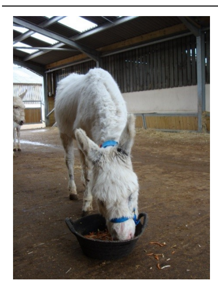
Photo 16. Elderly or infirm donkeys benefit from supplementary feeding with non-cereal based feeds

All feed sources should be of good hygienic and nutritional quality and stored under hygienic conditions: dusty, mouldy or rancid feed should always be disposed of. Feeding equipment should be kept clean and placed in a way that minimizes contamination.