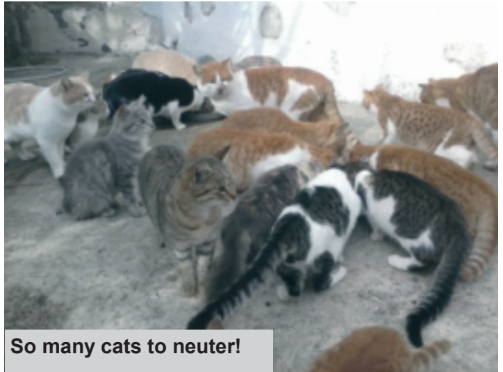
So many cats to neuter!

Neuter and Release (TNR) programmes in collaboration with local authorities and also local vets. It has taken a lot of patience to get to this point but we are thrilled to be working in this way as we are able to reach many more animals and people – thus raising awareness of how important neutering and vaccinating cats and dogs is to controlling the numbers of strays and improving the health of animals living on the streets.