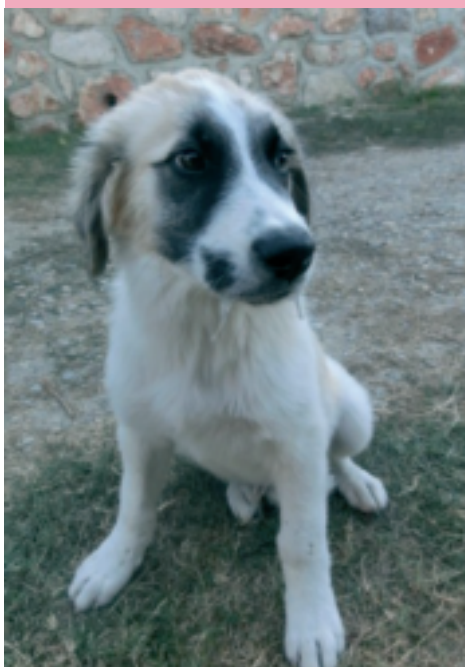
The little puppy in Halkidiki

My race started well, although underfoot it was already pretty muddy and would only get worse. On the bike and we had 3 laps of an undulating single track course through the woods to contend with.