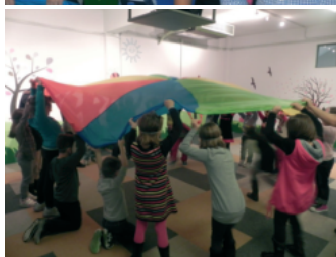
Above: children put themselves in the place of animals and represent them in the Great Djinn's court!

Greek Animal Welfare Fund—over 50 years of action for animals in Greece